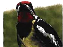
YELLOW BELLIED SAP- SUCKER