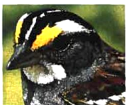
WHITE THROATED SPARROW