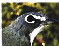
BLUE HEADED VIREO