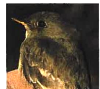
EASTERN WOOD PEE- WEE