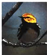
BLACK THROATED GREEN WARBLER